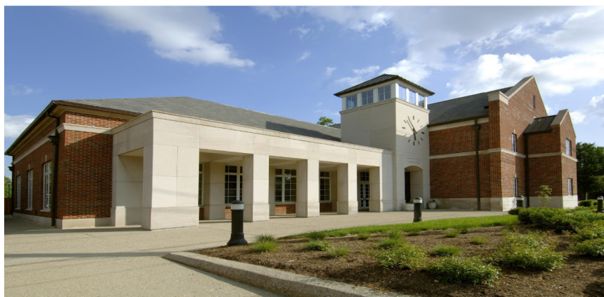
Stuckert Career Center at the University of Kentucky, Dedicated October 10, 2000